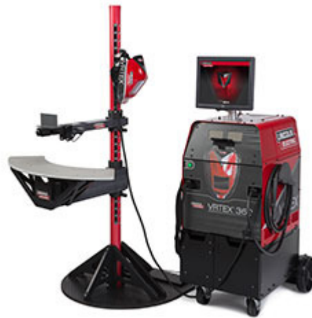
Figure 4. Welding Simulator

Trades can also use simulation to allow a safer environment for people to learn in. Figure 4 shows the equipment used to train welders at all levels. These may include those who are experienced and are checking their technique before attempting their regular certification, and novices who have no previous experience or expertise.