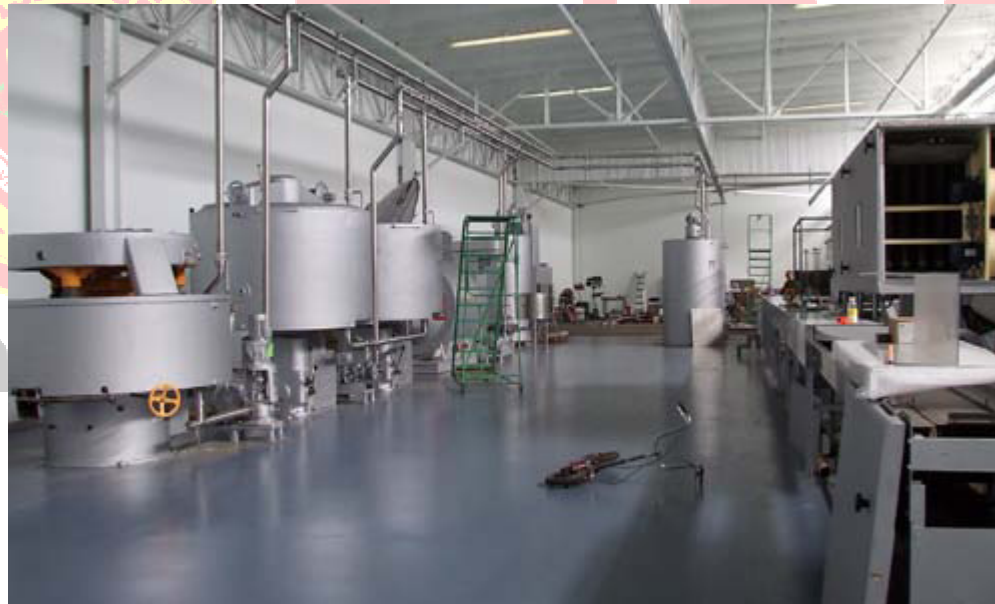
Figure 3. The real factory floor [Source: Back et al., 2010]