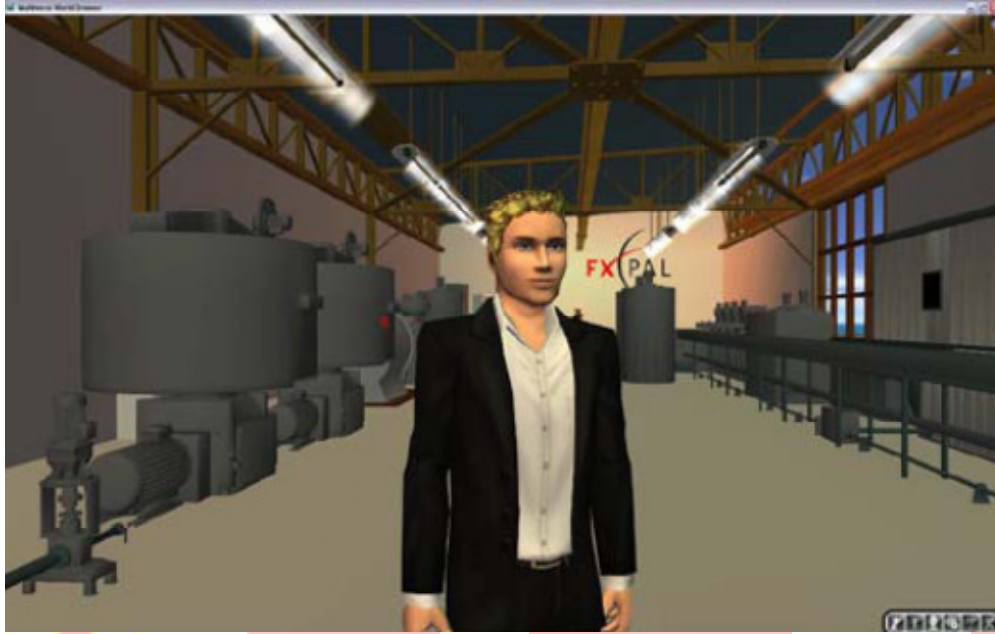
Figure 2. Avatar in the virtual factory